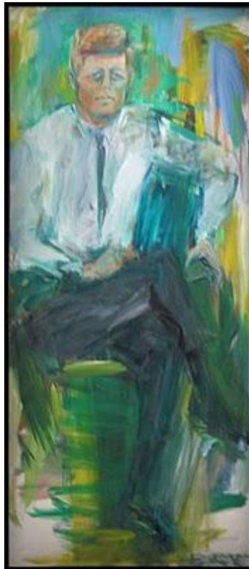
Portrait of John F. Kennedy by Elaine de Kooning