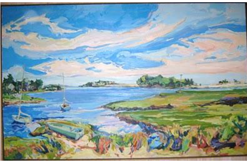
From Landing Lane, Jim Touchton (unavailable)