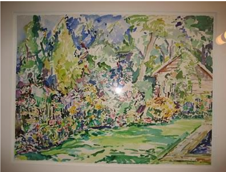
Poolside, East Hampton