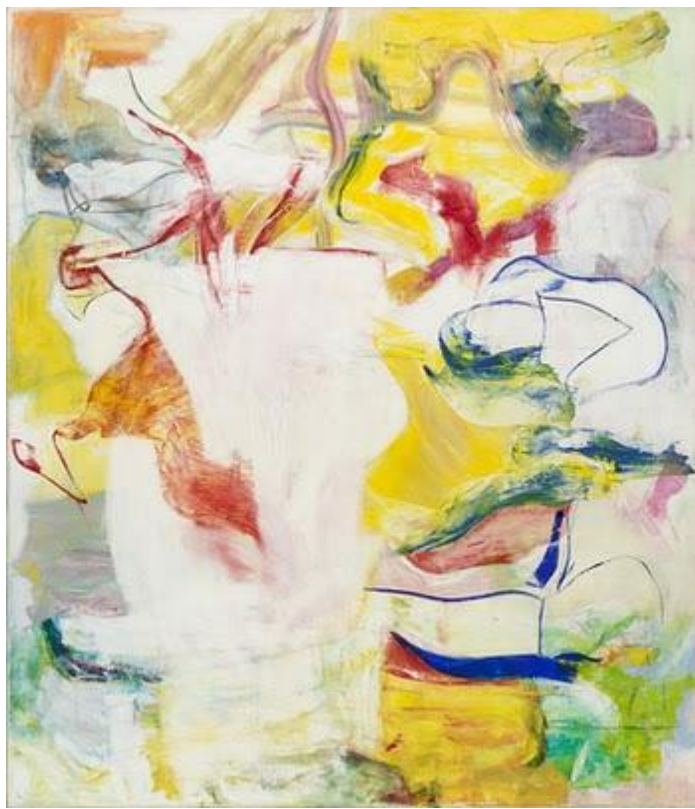
Pirate (Untitled II), 1981