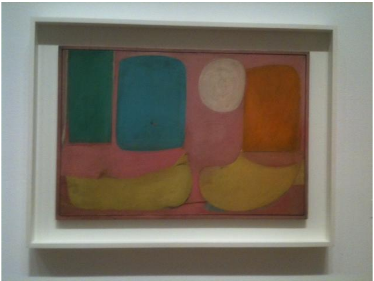
Pink Landscape, c.1942