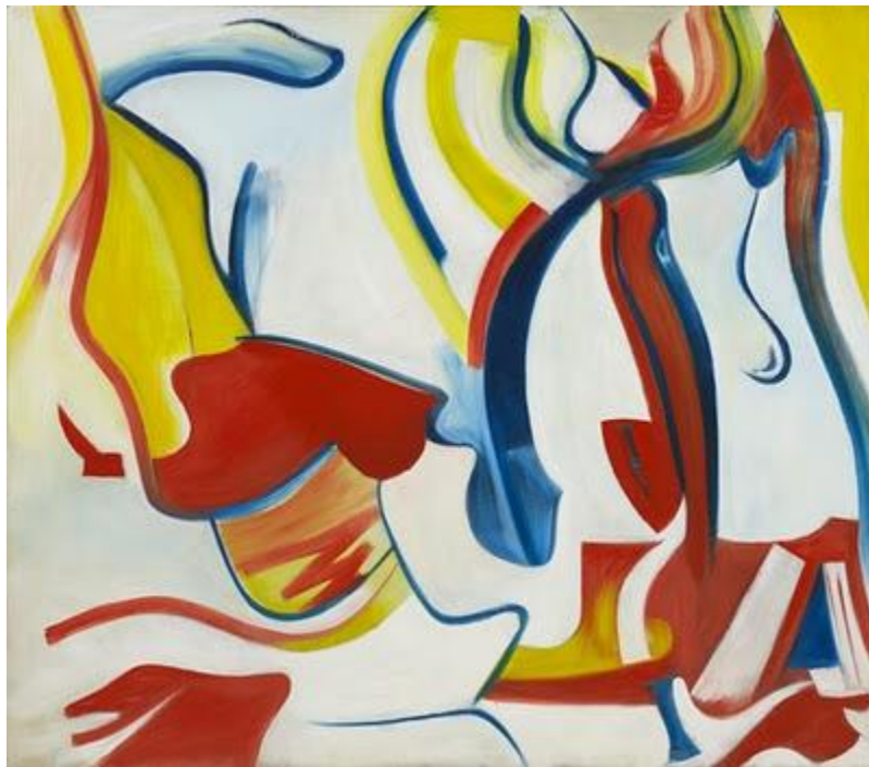
Rider (Untitled VII), 1985

One of the last few works of art created by de Kooning before his Alzheimers took over.