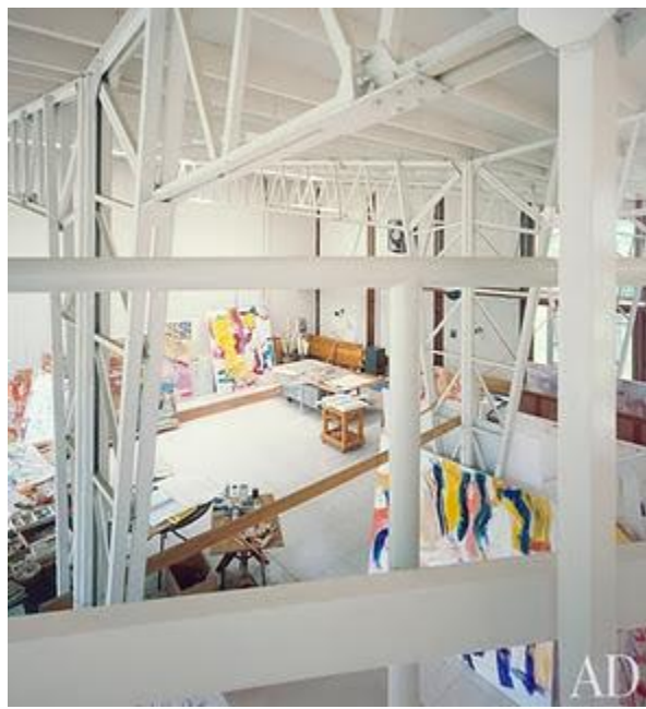
Photos of de Kooning's Studio/Home in East Hampton shot by Architectural Digest before he passed away.