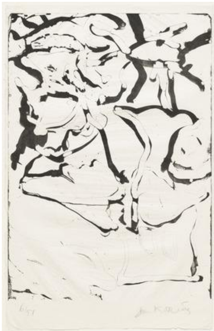
Wah Kee Spare Ribs, 1970 (published 1971) lithograph