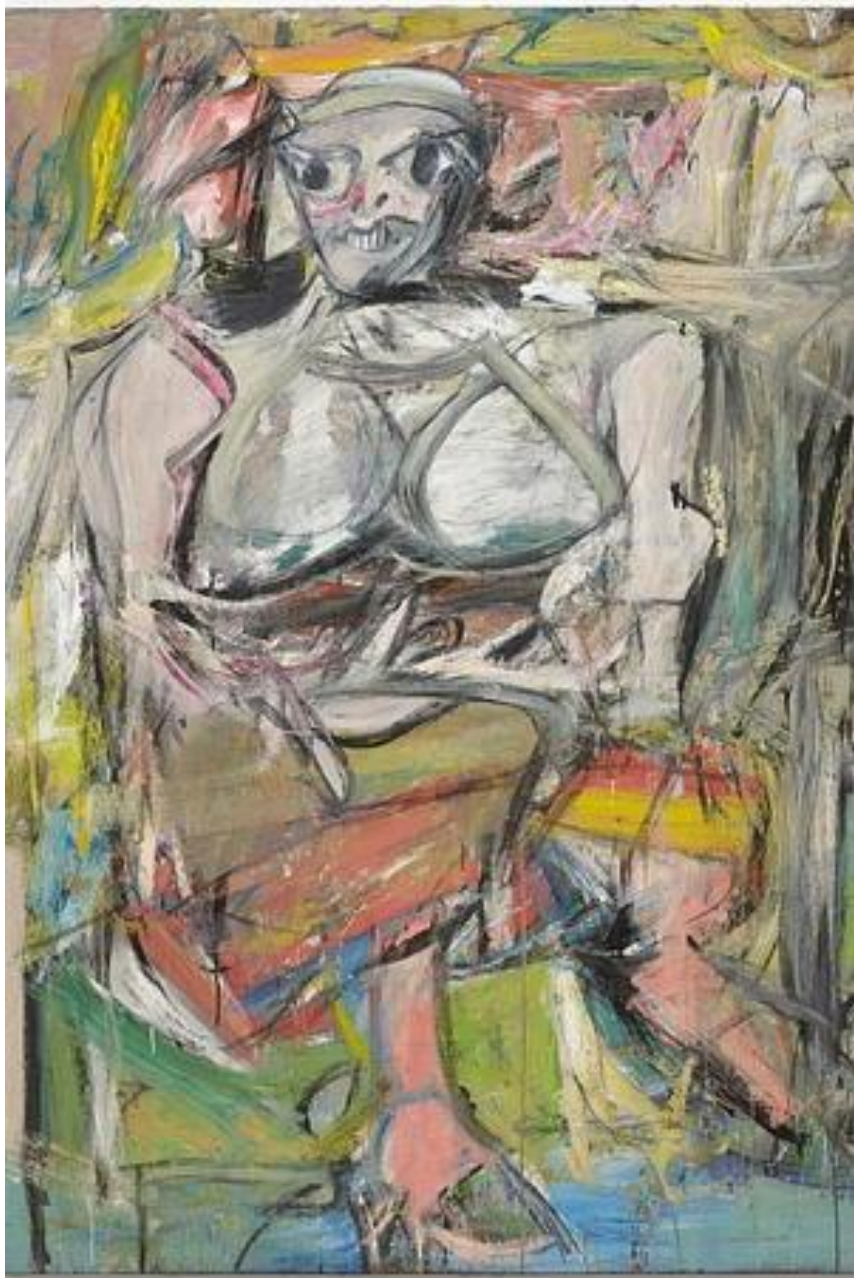
Woman, I (1950-1952)