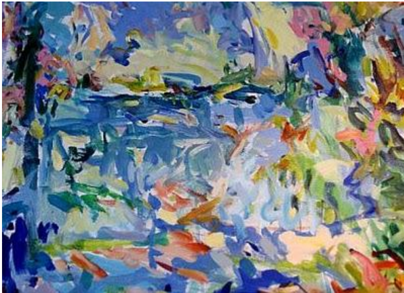
Morning Lake (unavailable)

Currently at the Museum of Modern Art is one of the largest de Kooning exhibits on display until January 9, 2012. Take a close look at his art and see all of the physical mechanics put into each painting as he started to paint, scraped some paint off, drew some drawings, added some material, and then painted again. The amount of energy put forth in every piece is thrilling and leaves you begging for more!